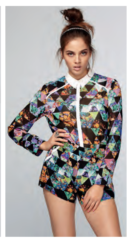
SERIOUSLY COVETING FLORALS BUT NO WALLFLOWERS PLEASE. MASH IT WITH THE HOTTEST COLOURS AND STAND OUT AT THE PARTY.